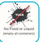
No Food or Liquid (empty all containers)

*For best results residents should have all properly prepared materials at the curb no later than 7:00 am. Remember, you have a service day not a collection time, routes run until finished. For any service issues always call MMWA at (989) 781-9555 within one business day of your service day.