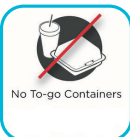
No To-go Containers