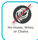
No Hoses, Wires, or Chains