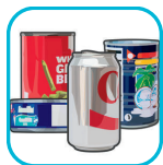
CANS Aluminum and Steel (clean, empty, and dry)