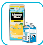
CARTONS (clean, empty, and dry)