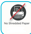
No Shredded Paper