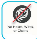
No Hoses, Wires, or Chains