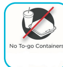
No To-go Containers