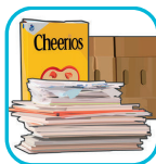
PAPER Cereal Boxes, Paper, Newspapers, Magazines, and Cardboard (all colors and types)