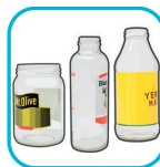
GLASS BOTTLES AND JARS (clean, empty and dry)