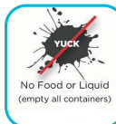
No Food or Liquid (empty all containers)

*For best results residents should have all properly prepared materials at the curb no later than 7:00 am. Remember, you have a service day not a collection time, routes run until finished. For any service issues always call MMWA at (989) 781-9555 within one business day of your service day.