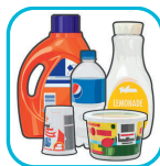
PLASTIC Plastic Bottles, Jars, and Tubs (clean, empty, and dry)