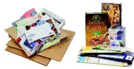
PAPER Cereal Boxes, Paper, Newspapers, Magazines, and Cardboard (all colors and types)