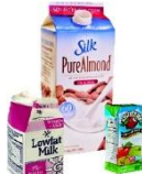
CARTONS (clean, empty, and dry)