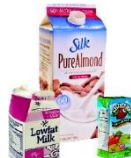
CARTONS (clean, empty, and dry)