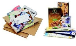
PAPER Cereal Boxes, Paper, Newspapers, Magazines, and Cardboard (all colors and types)