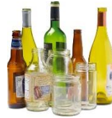
GLASS BOTTLES AND JARS (clean, empty, and dry)