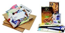
PAPER Cereal Boxes, Paper, Newspapers, Magazines, and Cardboard (all colors and types)