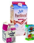
CARTONS (clean, empty, and dry)