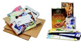
PAPER Cereal Boxes, Paper, Newspapers, Magazines, and Cardboard (all colors and types)