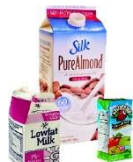
CARTONS (clean, empty, and dry)