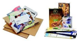
PAPER Cereal Boxes, Paper, Newspapers, Magazines, and Cardboard (all colors and types)