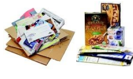
PAPER Cereal Boxes, Paper, Newspapers, Magazines, and Cardboard (all colors and types)