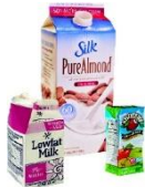
CARTONS (clean, empty, and dry)