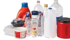
PLASTIC Plastic Bottles, Jugs, and Tubs (clean, empty, and dry)