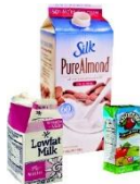
CARTONS (clean, empty, and dry)