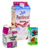
CARTONS (clean, empty, and dry)