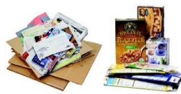
PAPER Cereal Boxes, Paper, Newspapers, Magazines, and Cardboard (all colors and types)