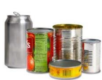
CANS Aluminum and Steel cans (clean, empty, and dry)

Please put ONLY the below materials into the curbside recycling container. Keep them clean, empty, dry, and loose. All recyclables can be mixed together and placed into the cart with the GREEN lid.