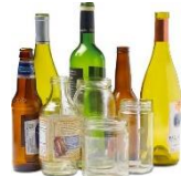
GLASS BOTTLES AND JARS (clean, empty, and dry)