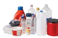
PLASTIC Plastic Bottles, Jugs, and Tubs (clean, empty, and dry)