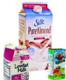
CARTONS (clean, empty, and dry)